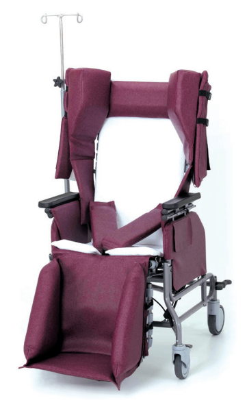
785 with Huntington's Padding (HSP) and IV Pole