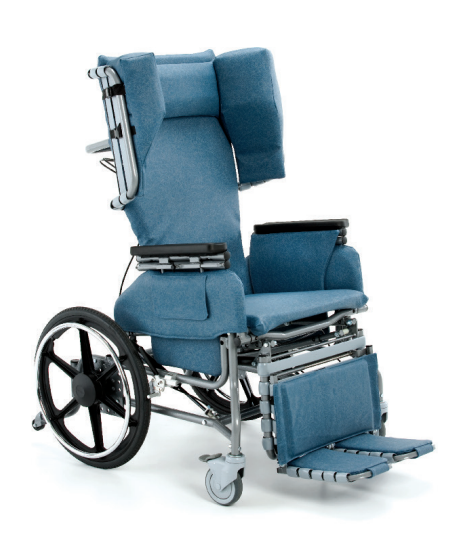
785 with full vinyl covers and mag wheels